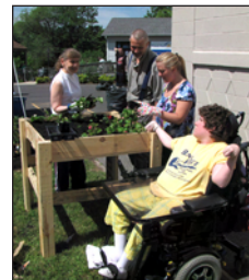
Digging in the dirt!