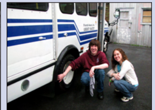
Bishop Walsh students stopped by to give the Friends Aware transportation fleet a shine.