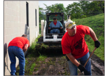
Moving ground at the Life Enrichment Center.