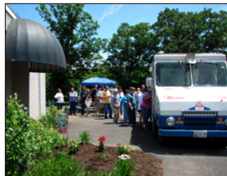
Mister Softee sweetened the day!

On Beautification Day, the Friends Aware community of friends, family, Board members, staff, and volunteers gathered to beautify the agency grounds. They spent the day pulling weeds, pruning, planting and mulching. Warm thanks go to all who donated supplies and participated in the day's events.