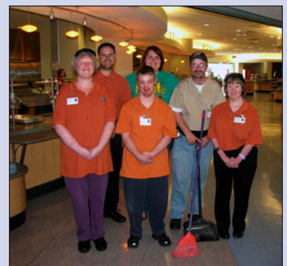
Proud new employees of Western Maryland Health System.